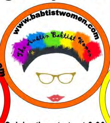
Celebration starts at 6:00